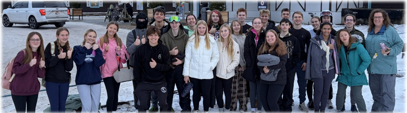
Lutheran Youth Fellowship at Emanuel